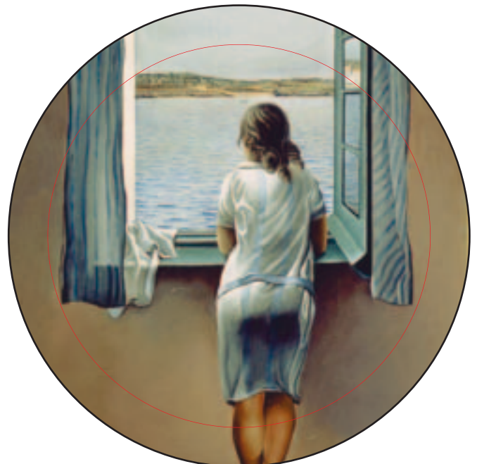
77mm badge or mirror Cutting circle 87mm Image area 72mm