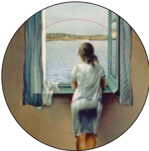
55mm badge Cutting circle 68mm Image area 52mm