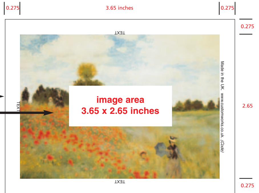
image area 3.65 x 2.65 inches

outer cutting guide: 4.2 inches x 3.2 inches image area: 3.65 inches x 2.65 inches image area positioning: from left 0.275 inches from top 0.275 inches Text box: height 0.08 inches